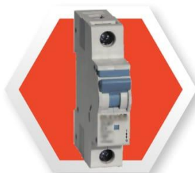
Single Phase Circuit Breaker = 1 Circuit

Whatever sector your business is in, or where you are located, we can help out. We have many satisfied customers in education, industrial, pharmaceutical, and banking. Whatever size your business is, we can help you.