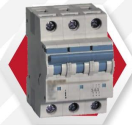
Three Phase Circuit Breaker = 3 Circuits