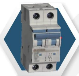
Two Pole or RCBO Circuit Breaker = 2 Circuits